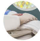
U-shaped cushion and weighted blanket